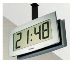
On double sided bracket