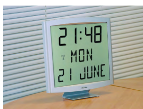
Cristalys Date on table support

The NTP server must have a transmission (Poll) period of less than 128 seconds.