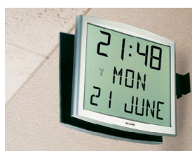
Cristalys Date on double sided bracket