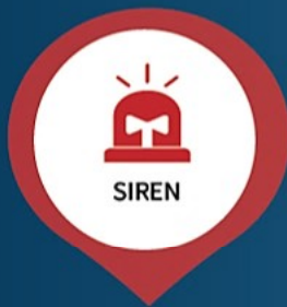
12 VOLT SIREN OR 12 VOLT BELL