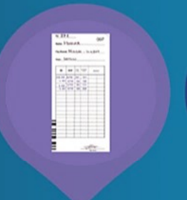
QR 375 D TIME CARDS