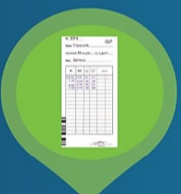
QR 375 S TIME CARDS