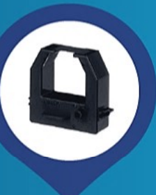
KP-201 RIBBON CASSETTE