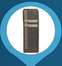
CARD RACK CRG 25 X 86